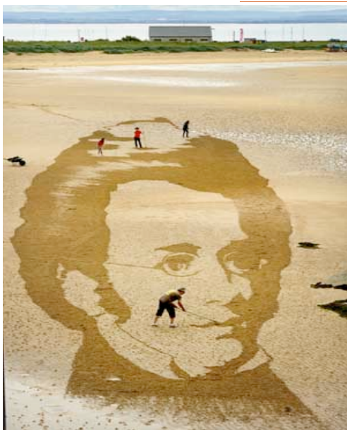
Schubert on the Beach 2014