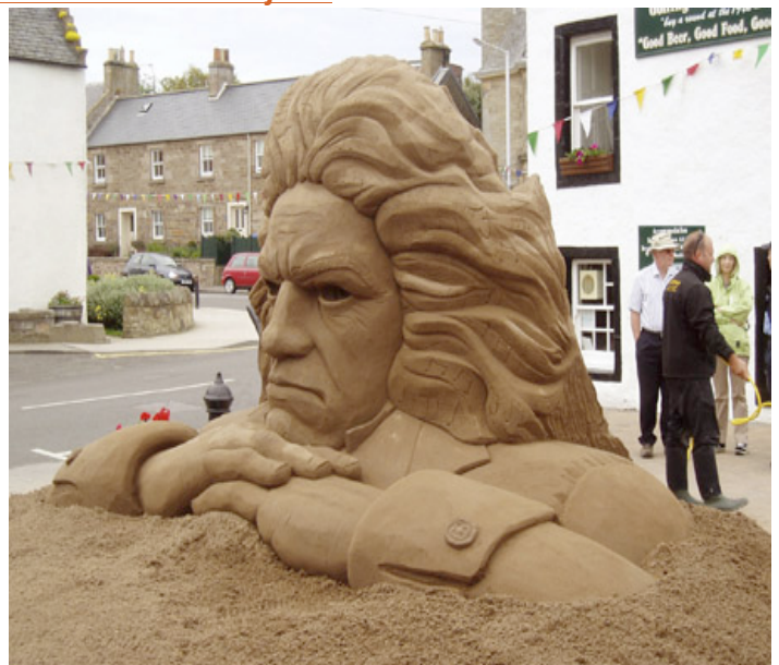
Beethoven Sand Sculpture 2011